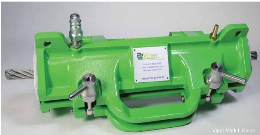
Viper Mark II Collar